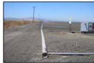
EXISTING PRIVATE DRIVEWAY PARALLEL WITH ROUTE 25