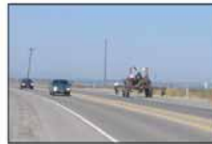
CONFLICTS WITH SLOW MOVING FARM VEHICLES