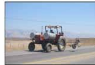
CONFLICTS WITH SLOW MOVING FARM VEHICLES