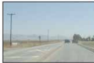
CONFLICTS WITH SLOW MOVING FARM VEHICLES