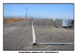
EXISTING PRIVATE DRIVEWAY PARALLEL WITH ROUTE 25