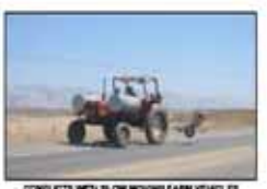
CONFLICTS WITH SLOW MOVING FARM VEHICLES