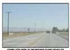
CONFLICTS WITH SLOW MOVING FARM VEHICLES