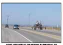
CONFLICTS WITH SLOW MOVING FARM VEHICLES