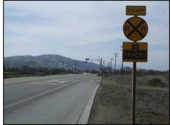
Highway 25 at the Railroad Crossing

The project includes shoulder widening, grading, paving, drainage, utility relocation, signing and striping, and a concrete median barrier. The project is approximately 7 miles in length.