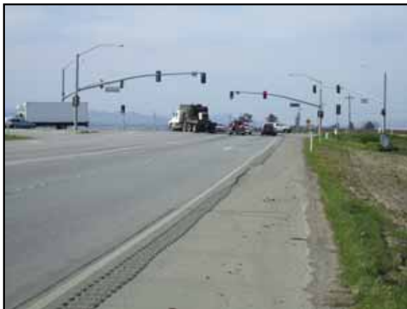
Highway 25 at Highway 156

The project is fully funded through construction with City of Hollister Redevelopment Agency and Proposition 1B (State Transportation Improvement Program) funds.